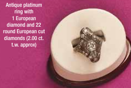
Antique platinum ring with 1 European diamond and 22 round European cut diamonds (2.00 ct. t.w. approx)