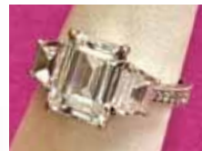
18 kt. white gold ring with 3.09 ct. internally flawless emerald cut diamond with 2 trapezoid diamonds (1.03 ct.) and 28 round brilliant cut diamonds (0.24 ct.)