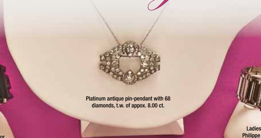
Platinum antique pin-pendant with 68 diamonds, t.w. of approx. 8.00 ct.