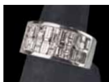
18K white gold ring with 10 baguette and 20 brilliant cut diamonds that are "VS2" clarity and "G" color (2.5 ct. total weight)