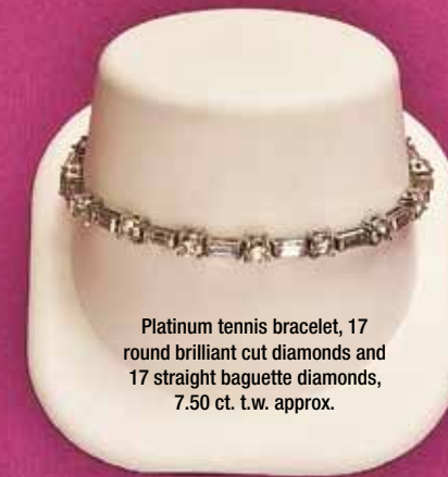
Platinum tennis bracelet, 17 round brilliant cut diamonds and 17 straight baguette diamonds, 7.50 ct. t.w. approx.