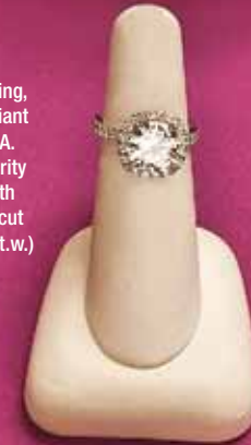
18 kt. white gold ring, 4.01 ct. round brilliant cut diamond (G.I.A. certified "SI/1" clarity and "F" color) with 54 round brilliant cut diamonds (1.10 ct. t.w.)