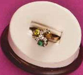
18 kt. yellow gold ring, 3 "irradiated" diamonds (0.89 cts. t.w.) and 10 round brilliant cut diamonds (0.70 cts. t.w.)