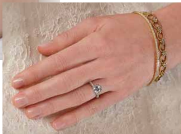
Roberto Coin bangle bracelet in 18k yellow gold with 0.67 total carat weight diamonds; Leslie Green diamond bezel linked bracelet in 18k yellow gold with 0.96 total carat weight diamonds