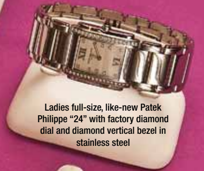
Ladies full-size, like-new Patek Philippe "24" with factory diamond dial and diamond vertical bezel in stainless steel