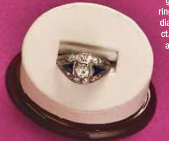
14 kt. white gold antique ring, 9 European diamonds (2.00 ct. t.w. approx) and 2 trillion sapphires