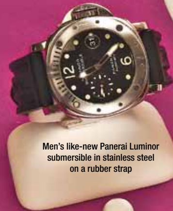
Men's like-new Panerai Luminor submersible in stainless steel on a rubber strap