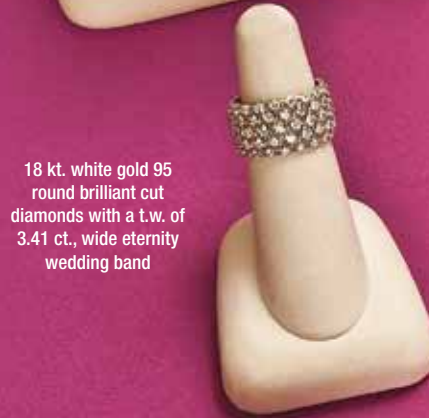
18 kt. white gold 95 round brilliant cut diamonds with a t.w. of 3.41 ct., wide eternity wedding band