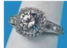
Handmade Tacori diamond ring in 18K white gold with a 2 ct. round, brilliant diamond center, a halo of round, brilliant cut diamonds along with diamonds accenting on the shank (0.91 ct. total weight)