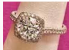
18 kt. white gold ring with 3.07 ct. round brilliant cut diamond (G.I.A. certified "SI/2" clarity and "H" color) with 20 round brilliant cut diamonds (0.40 ct.)