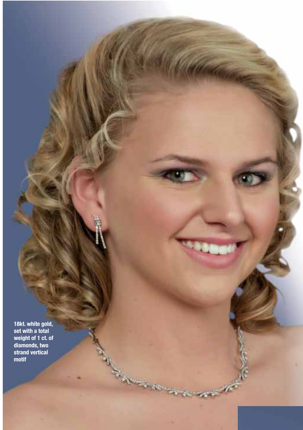
18kt. white gold, set with a total weight of 1 ct. of diamonds, two strand vertical motif