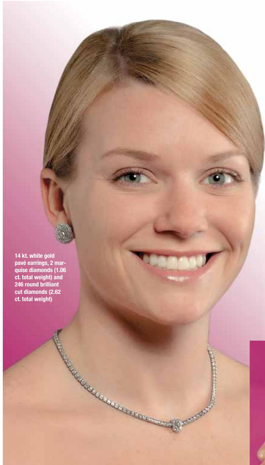
14 kt. white gold pavé earrings, 2 marquise diamonds (1.06 ct. total weight) and 246 round brilliant cut diamonds (2.62 ct. total weight)