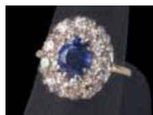
Platinum and 18K yellow gold estate sapphire ring with 1.72 ct. sapphire surrounded by 10 "VS2" clarity and "H" color diamonds (1 ct. total weight)