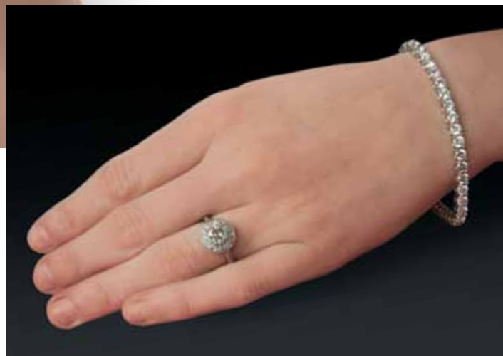
A. Link 18k white gold diamond tennis bracelet with 43 "VS2" clarity diamonds, "G-H" color (10 ct. total weight)