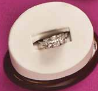
Platinum 3-oval diamond anniversary ring with center oval 0.91 ct. (G.I.A. certified "VS/2" clarity and "D" color) (2 = 1.06 ct. t.w. "VS" clarity "D" color)