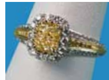
Fancy yellow diamond ring by Christopher Designs in 18K two-tone gold with a 0.89 ct. radiant cut, fancy yellow diamond center, accented with 16 fancy yellow round, brilliant diamonds