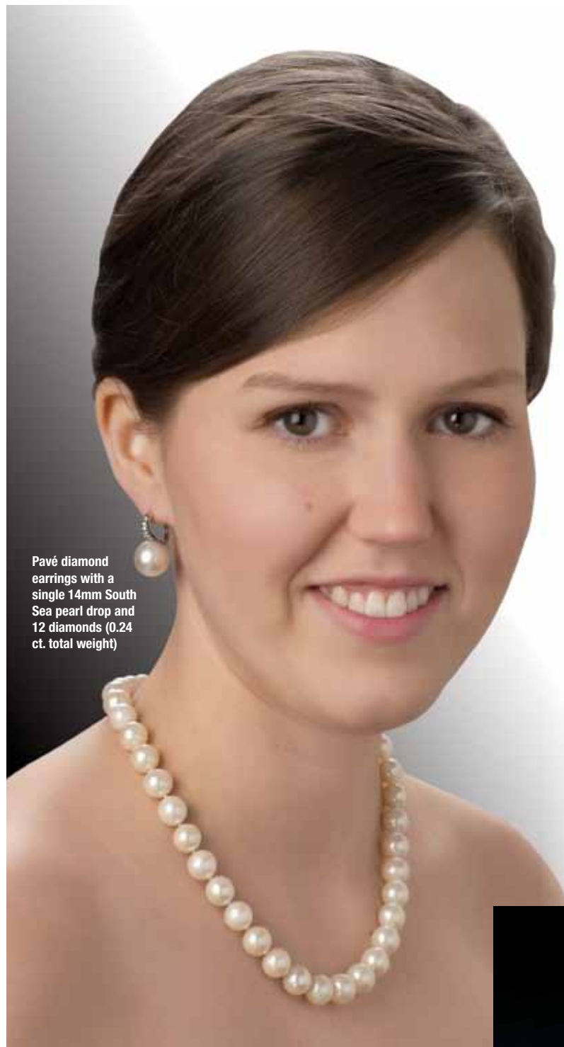
Pavé diamond earrings with a single 14mm South Sea pearl drop and 12 diamonds (0.24 ct. total weight)