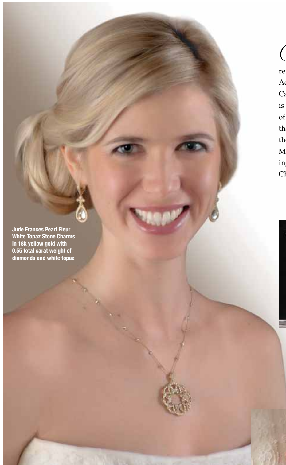
Jude Frances Pearl Fleur White Topaz Stone Charms in 18k yellow gold with 0.55 total carat weight of diamonds and white topaz