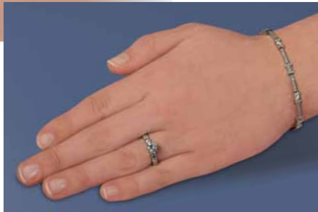
18kt. white gold bracelet, Victorian design, featuring 2.25 ct. of bead-set diamonds with ornate milled grain motif