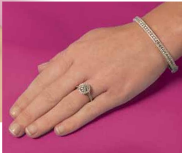
18 kt. white gold 3-row bangle bracelet with 155 round brilliant cut diamonds (2.80 ct. total weight)