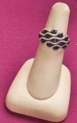
18 kt. white gold "Gregg Ruth" ring, 134 round brilliant cut diamonds (0.85 ct.) and 13 round sapphires (2.76 ct.)