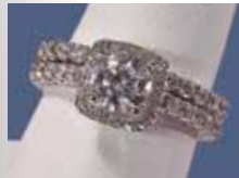
Round brilliant cut 1 ct. diamond, encompassed by a halo setting, accent diamonds draping the shank. Exclusive Sam Edwards Jewelers design