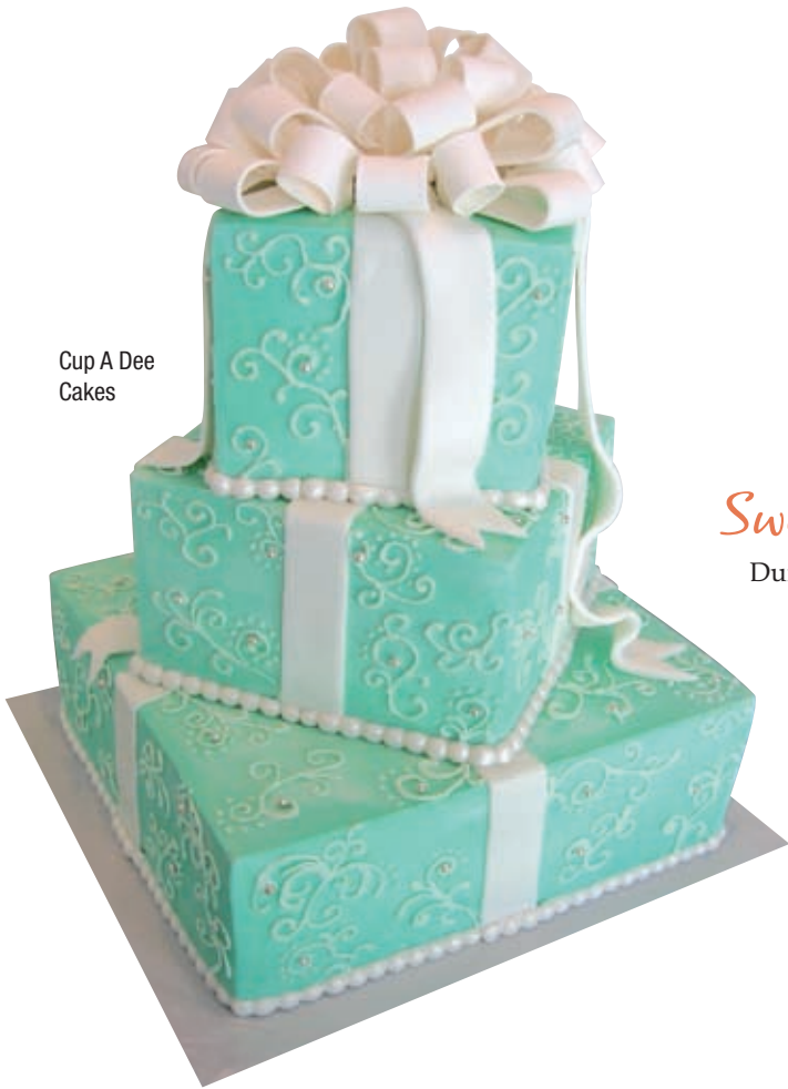
Cup A Dee Cakes