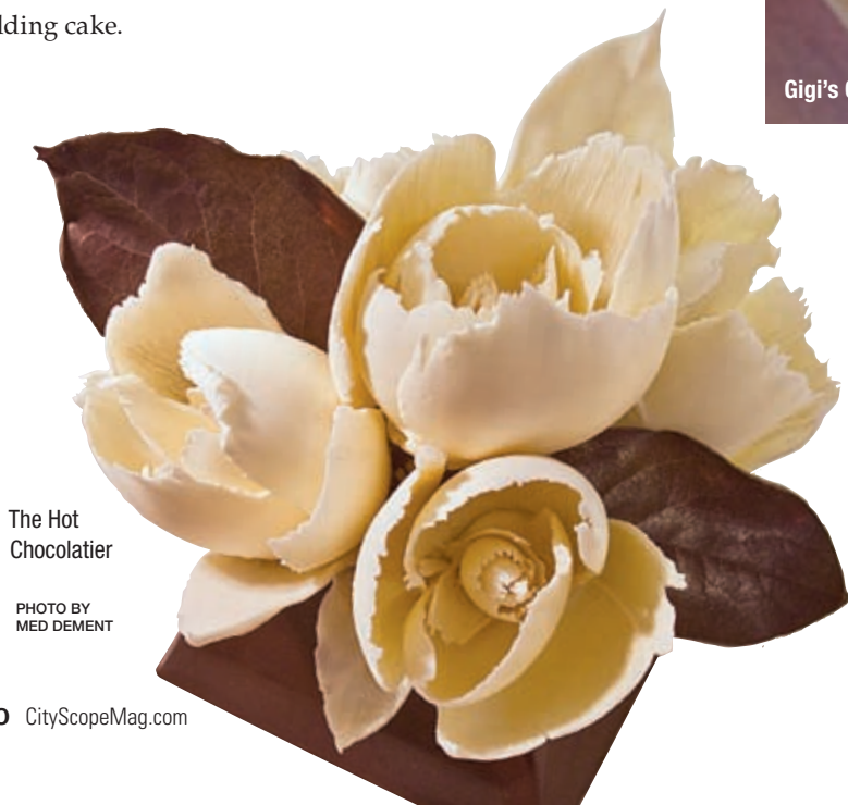
The Hot Chocolatier